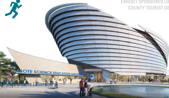
Mote Marine Laboratory