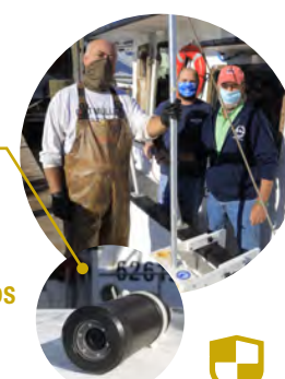
"GROUPEER GUARD" Mote scientists are helping study grouper as national security sentinels. FLORIDA ATLANTIC UNIVERSITY STUDY WITH MOTE PARTNERS