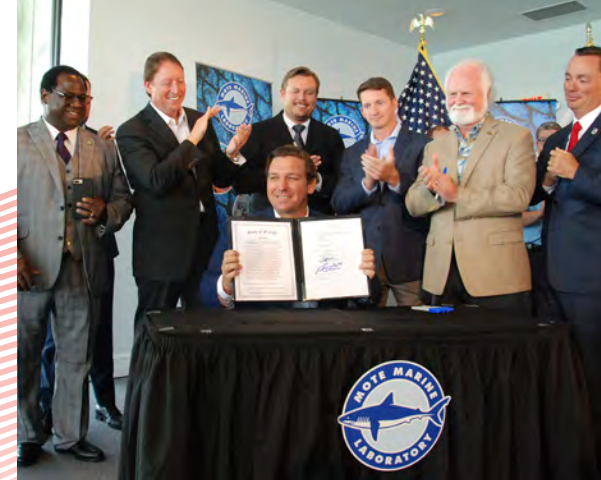
Above: Governor DeSantis signs the Initiative into law in 2019.

Before the Initiative was in full swing, Mote’s existing research programs—including its Red Tide Institute supported by the Andrew and Judith Economos