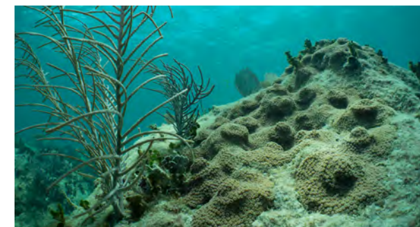
Above: Mote scientists use a process called microfragmentation-fusion to restore slow-growing corals to mature sizes faster.

“mesocosm” or “raceway” tanks designed to provide a preview of the possible environmental impacts. This year, Mote created a cutting-edge facility to do just that, as part of the Florida Red Tide Mitigation & Technology Development Initiative led by Mote in partnership with the Florida Fish and Wildlife Conservation Commission (FWC). The facility, occupying 28,800 square feet of Mote's existing campus space, can hold almost 150,000 gallons of treated and recirculated seawater. Its six labs include a culture room for growing algae, a chemistry lab, and large systems of long tanks called raceways and 5- or 10-foot mesocosms where scientists can create mini versions of Sarasota Bay, the Gulf of Mexico or other relevant environments by maintaining shellfish, seaweed, sponges, sediments and other ecosystem components that could be sensitive to mitigation efforts. Use of the facility and its unprecedented quantities of Karenia brevis culture are free for scientists from around the world whose projects are part of the Initiative.