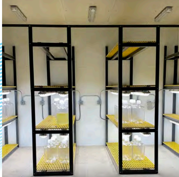
Above: The culture lab at Mote's new red tide facility at MAP.