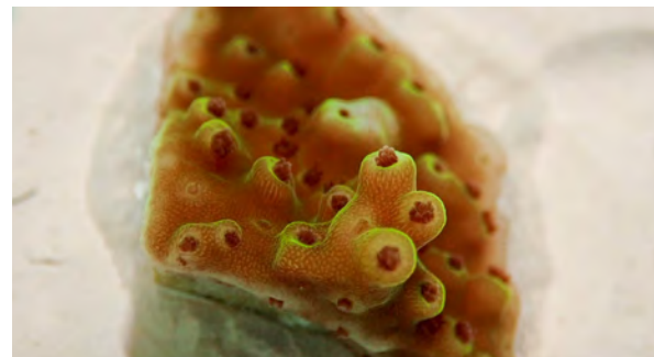
Above: Coral fragments in Mote's International Coral Gene Bank.