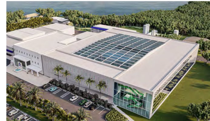
Above: Renderings of the envisioned evolution of Mote's City Island, Sarasota, campus. Courtesy of Hall Darling Design Studio.