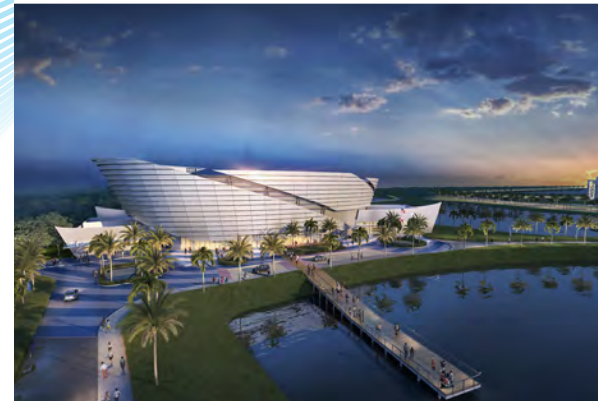
Above: Renderings of the envisioned Mote Science Education Aquarium at Nathan Benderson Park.