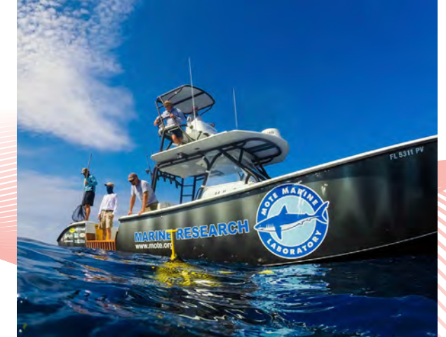
Above: Mote scientists pioneer new technology to study red tide.

Also thanks to Initiative support, Mote and partners are developing better technologies to detect K. brevis and its toxins. For instance, Mote is taking early steps toward developing a biosensor that will detect red tide toxins rapidly in commercially important shellfish and seawater, to give shellfish farmers and industry regulators timelier updates on when shellfish harvest areas should or shouldn’t close to protect consumers. Successful technologies will improve further. Mote’s Programmable Hyperspectral Seawater Scanner